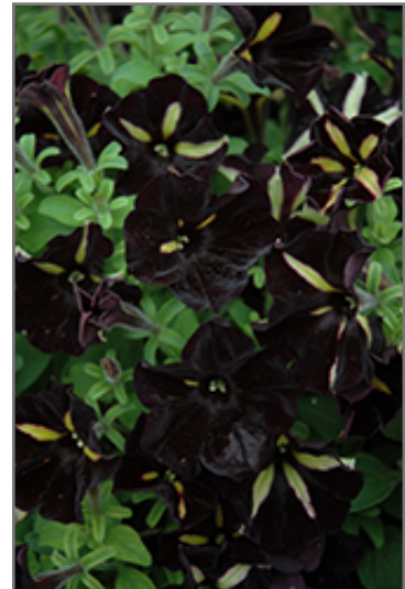
Phantom Petunia flowers