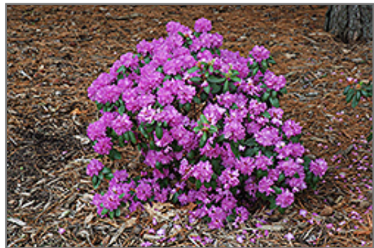
Compact P.J.M. Rhododendron in bloom