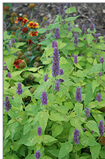
Golden Jubilee Anise Hyssop flowers

Golden Jubilee Anise Hyssop is a dense herbaceous perennial with an upright spreading habit of growth. Its medium texture blends into the garden, but can always be balanced by a couple of finer or coarser plants for an effective composition.