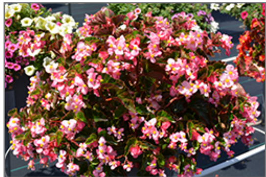
BabyWing Pink Begonia in bloom