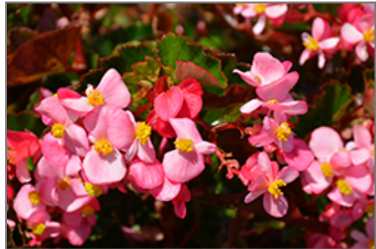
BabyWing Pink Begonia flowers

BabyWing Pink Begonia is an herbaceous annual with a mounded form. Its medium texture blends into the garden, but can always be balanced by a couple of finer or coarser plants for an effective composition.