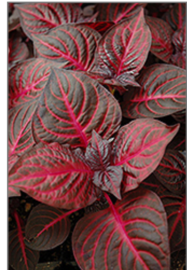
Blazin' Rose Blood Leaf foliage