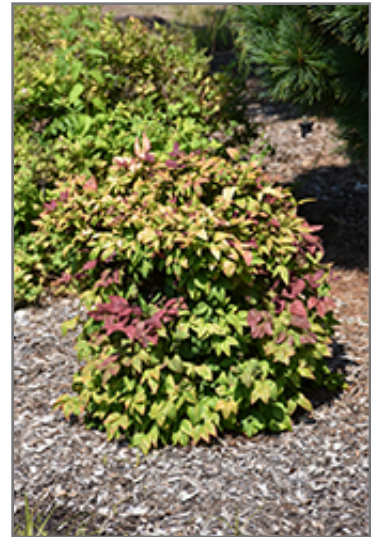
Blush Pink Nandina

Blush Pink Nandina makes a fine choice for the outdoor landscape, but it is also well-suited for use in outdoor pots and containers. It can be used either as 'filler' or as a 'thriller' in the 'spiller-thriller-filler' container combination, depending on the height and form of the other plants used in the container planting. It is even sizeable enough that it can be grown alone in a suitable container. Note that when grown in a container, it may not perform exactly as indicated on the tag - this is to be expected. Also note that when growing plants in outdoor containers and baskets, they may require more frequent waterings than they would in the yard or garden.