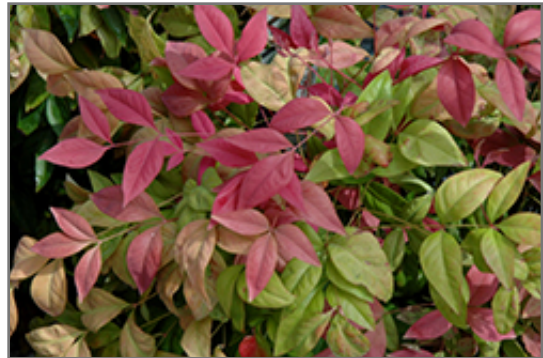
Blush Pink Nandina foliage

Blush Pink Nandina is recommended for the following landscape applications;