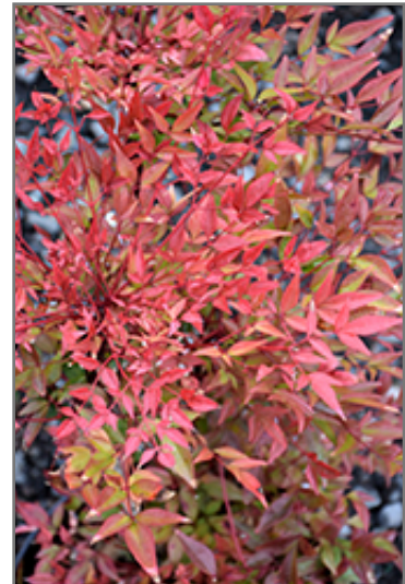
Obsession Nandina foliage

Obsession Nandina is recommended for the following landscape applications;