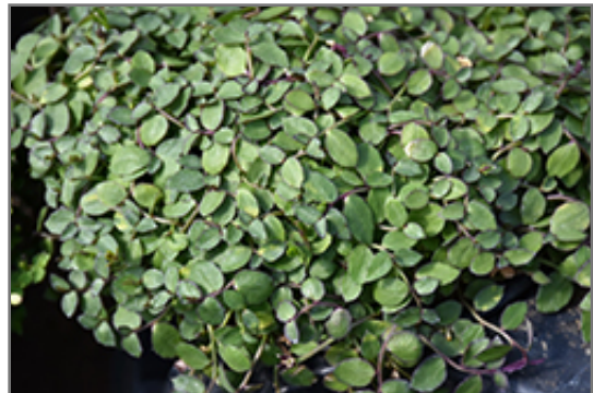
County Park Star Creeper foliage