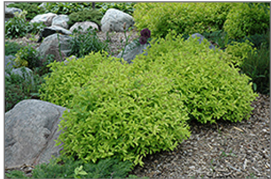
Goldmound Spirea

This shrub will require occasional maintenance and upkeep, and is best pruned in late winter once the threat of extreme cold has passed. It is a good choice for attracting butterflies to your yard, but is not particularly attractive to deer who tend to leave it alone in favor of tastier treats. It has no significant negative characteristics.