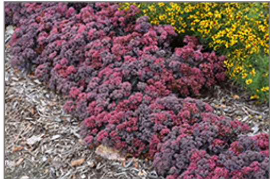
Dazzleberry Stonecrop in bloom