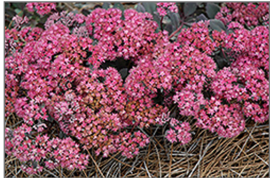
Dazzleberry Stonecrop flowers

Dazzleberry Stonecrop is a dense herbaceous perennial with an upright spreading habit of growth. Its medium texture blends into the garden, but can always be balanced by a couple of finer or coarser plants for an effective composition.