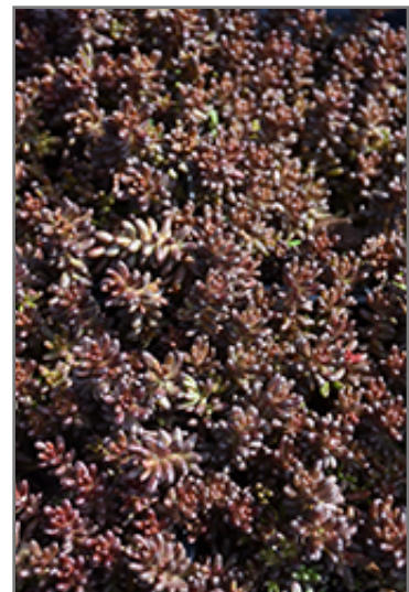
Murale Stonecrop foliage