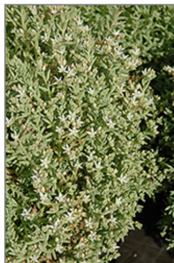
Tiny Buttons Stonecrop foliage

Tiny Buttons Stonecrop is recommended for the following landscape applications;