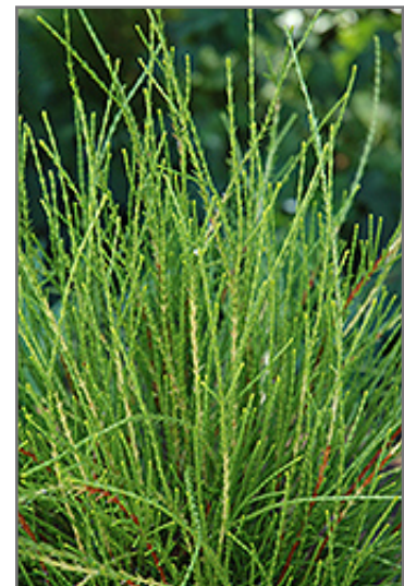
Franky Boy Arborvitae foliage