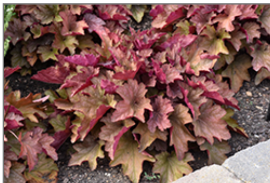
Carnival Watermelon Coral Bells