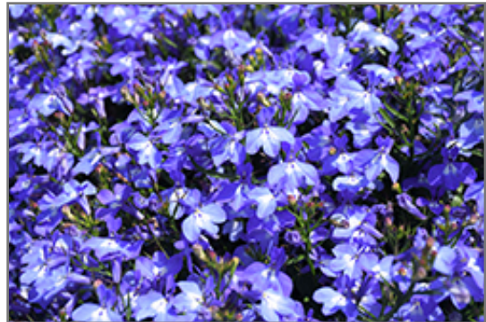
Techno Light Blue Lobelia flowers

This plant will require occasional maintenance and upkeep. Trim off the flower heads after they fade and die to encourage more blooms late into the season. It has no significant negative characteristics.