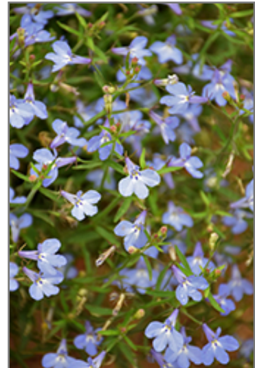
Techno Light Blue Lobelia flowers

Techno Light Blue Lobelia is a fine choice for the garden, but it is also a good selection for planting in hanging baskets. Because of its trailing habit of growth, it is ideally suited for use as a 'spiller' in the 'spiller-thriller-filler' container combination; plant it near the edges where it can spill gracefully over the pot. Note that when growing plants in outdoor containers and baskets, they may require more frequent waterings than they would in the yard or garden.