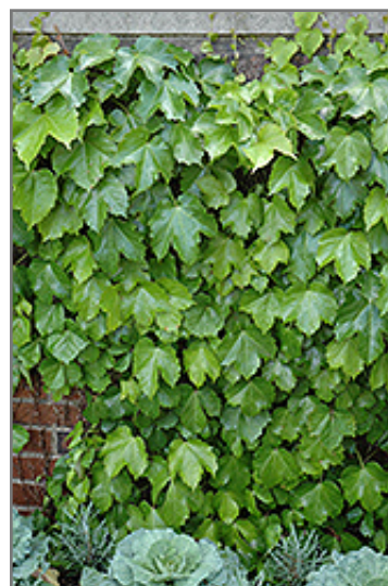
Veitch Boston Ivy

Veitch Boston Ivy is recommended for the following landscape applications;