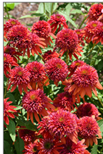
Double Scoop Orangeberry Coneflower flowers

This is a relatively low maintenance plant, and is best cleaned up in early spring before it resumes active growth for the season. It is a good choice for attracting butterflies to your yard, but is not particularly attractive to deer who tend to leave it alone in favor of tastier treats. It has no significant negative characteristics.