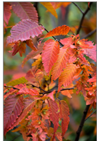
Firespire American Hornbeam in fall