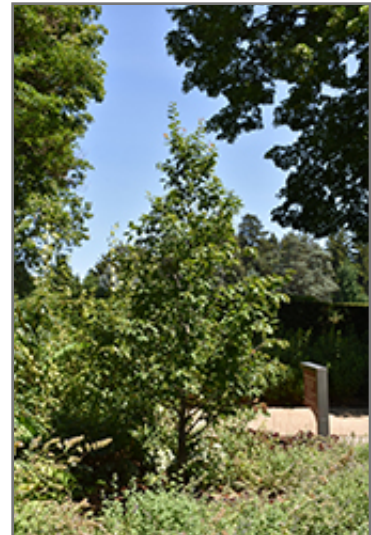
Firespire American Hornbeam

* This is a 'special order' plant - contact store for details