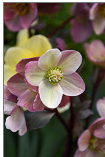
Pink Frost Hellebore flowers