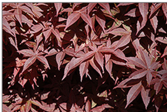
Rhode Island Red Japanese Maple foliage