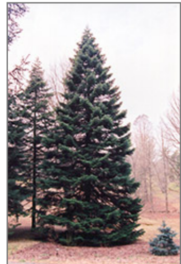
Nordmann Fir