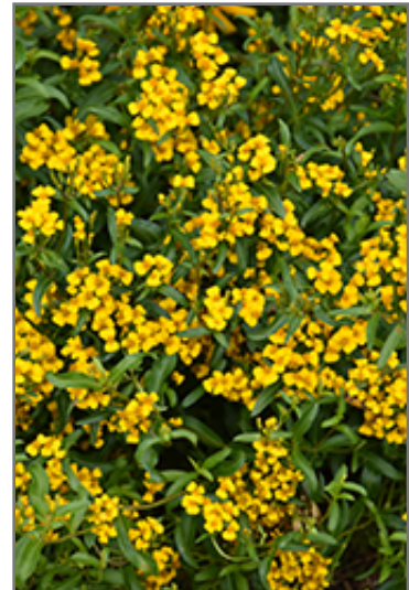
Mexican Tarragon flowers

Mexican Tarragon will grow to be about 30 inches tall at maturity, with a spread of 18 inches. Its foliage tends to remain dense right to the ground, not requiring facer plants in front. Although it's not a true annual, this plant can be expected to behave as an annual in our climate if left outdoors over the winter, usually needing replacement the following year. As such, gardeners should take into consideration that it will perform differently than it would in its native habitat.