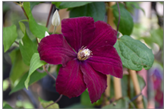
Rouge Cardinal Clematis flowers