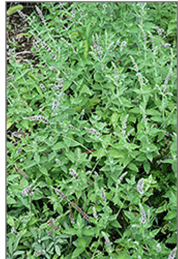
Pennyroyal in bloom

This is a relatively low maintenance plant, and should be cut back in late fall in preparation for winter. It is a good choice for attracting bees and butterflies to your yard, but is not particularly attractive to deer who tend to leave it alone in favor of tastier treats. Gardeners should be aware of the following characteristic(s) that may warrant special consideration;