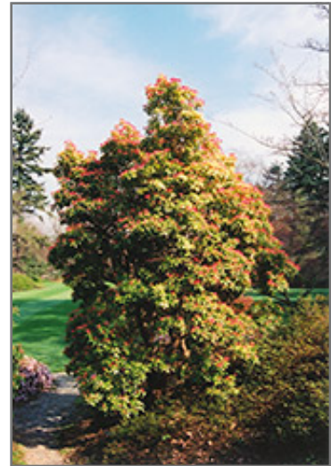
Valley Fire Japanese Pieris

This shrub does best in full sun to partial shade. It requires an evenly moist well-drained soil for optimal growth, but will die in standing water. It is very fussy about its soil conditions and must have rich, acidic soils to ensure success, and is subject to chlorosis (yellowing) of the foliage in alkaline soils. It is somewhat tolerant of urban pollution, and will benefit from being planted in a relatively sheltered location. Consider applying a thick mulch around the root zone in winter to protect it in exposed locations or colder microclimates. This is a selected variety of a species not originally from North America, and parts of it are known to be toxic to humans and animals, so care should be exercised in planting it around children and pets.