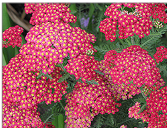
Galaxy Paprika Yarrow flowers