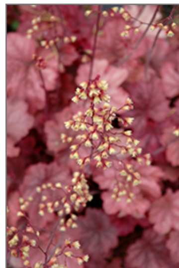
Root Beer Coral Bells flowers