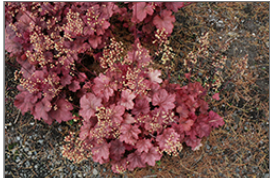
Root Beer Coral Bells in bloom