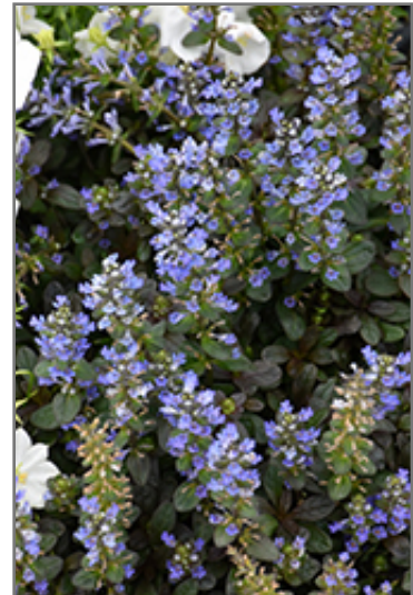
Chocolate Chip Bugleweed flowers