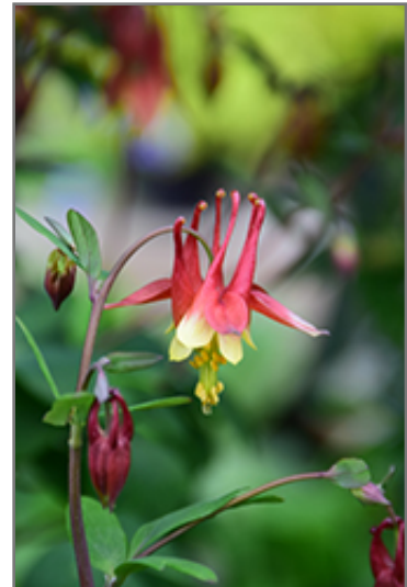
Wild Red Columbine flowers