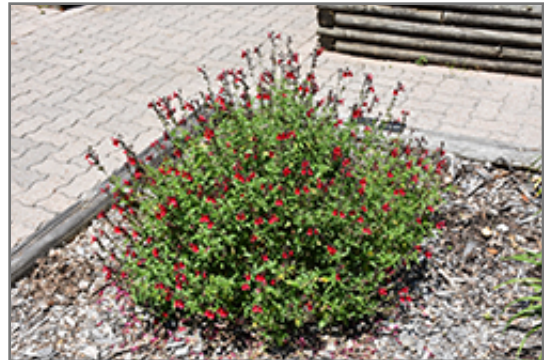
Radio Red Autumn Sage in bloom