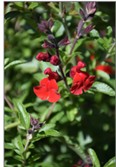
Radio Red Autumn Sage flowers