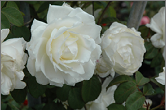
Cloud 10 Rose flowers

This woody vine will require occasional maintenance and upkeep, and should only be pruned after flowering to avoid removing any of the current season's flowers. It is a good choice for attracting bees and butterflies to your yard. Gardeners should be aware of the following characteristic(s) that may warrant special consideration;