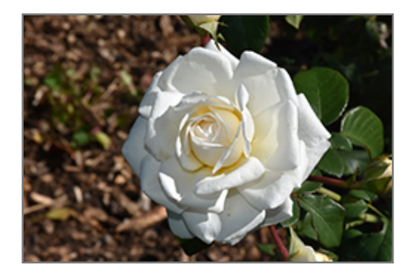
Cloud 10 Rose flowers

Cloud 10 Rose is a multi-stemmed deciduous woody vine with a twining and trailing habit of growth. Its average texture blends into the landscape, but can be balanced by one or two finer or coarser trees or shrubs for an effective composition.