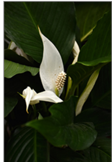
Peace Lily flowers