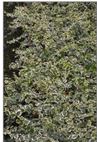
Variegated Creeping Fig in full