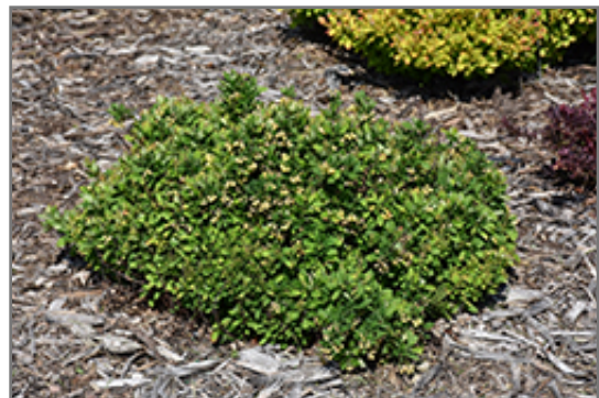
Moscato Barberry