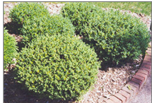
Japanese Boxwood