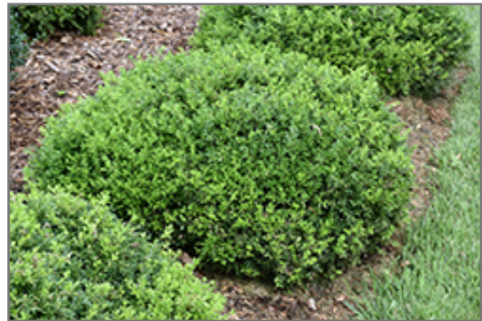
Tide Hill Boxwood