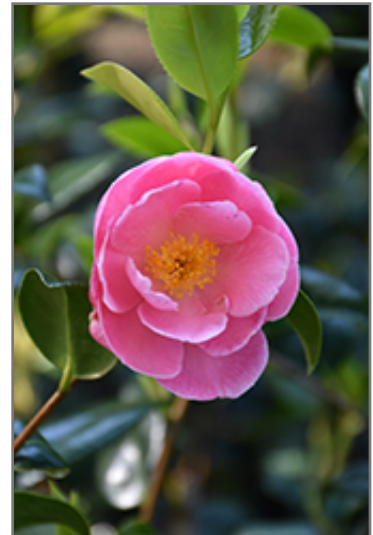
Pink Icicle Camellia flowers