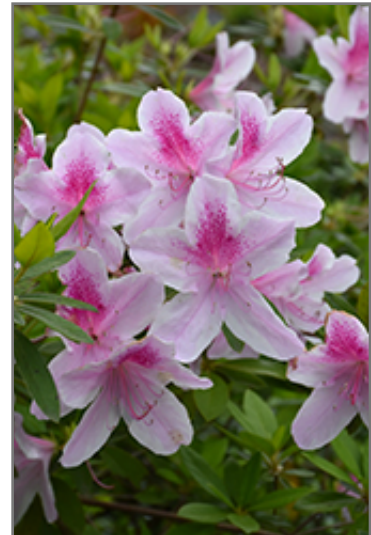
George Lindley Taber Azalea flowers

George Lindley Taber Azalea is recommended for the following landscape applications;