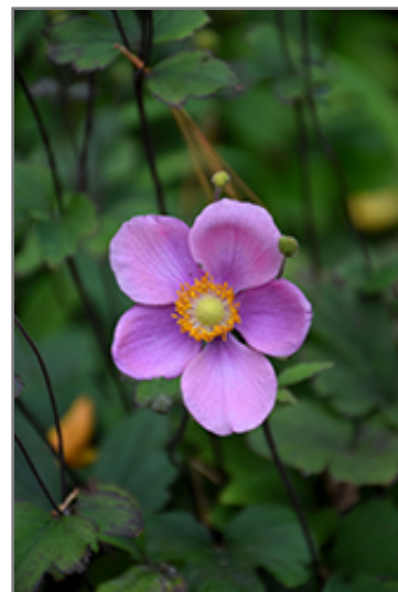
Lucky Charm Anemone flowers

Lucky Charm Anemone is recommended for the following landscape applications;