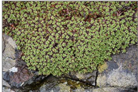
Cushion Bolax

Cushion Bolax is recommended for the following landscape applications;