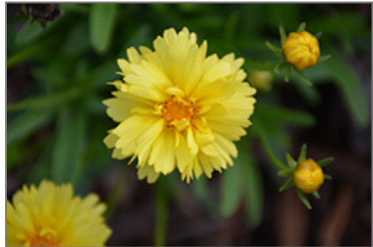
Leading Lady Charlize Tickseed flowers

Leading Lady Charlize Tickseed is recommended for the following landscape applications;