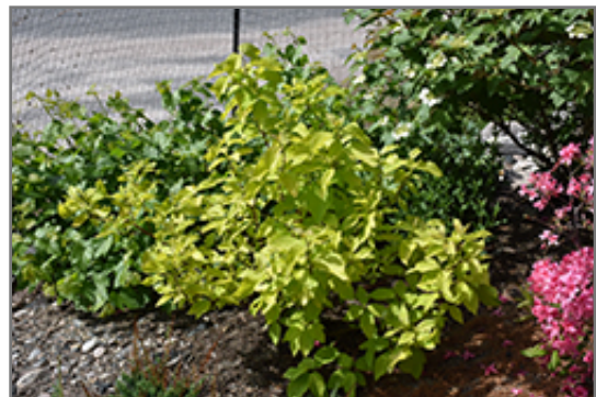
Neon Burst Dogwood