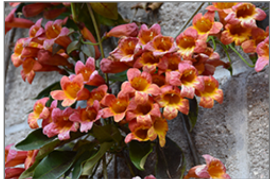
Tangerine Beauty Cross Vine flowers