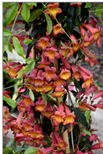
Tangerine Beauty Cross Vine flowers

Tangerine Beauty Cross Vine is a multi-stemmed deciduous woody vine with a twining and trailing habit of growth. Its average texture blends into the landscape, but can be balanced by one or two finer or coarser trees or shrubs for an effective composition.