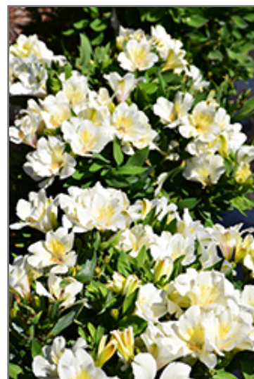
Colorita Claire Alstroemeria flowers