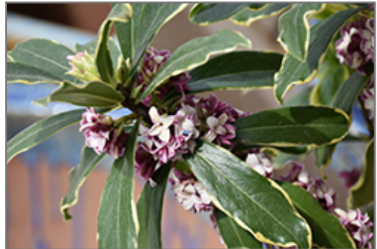
Moonlight Parfait Winter Daphne flowers

Moonlight Parfait Winter Daphne is a multi-stemmed evergreen shrub with a mounded form. Its relatively fine texture sets it apart from other landscape plants with less refined foliage.