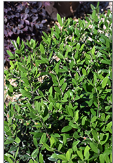
Little Ollie® Dwarf Olive foliage

* This is a 'special order' plant - contact store for details