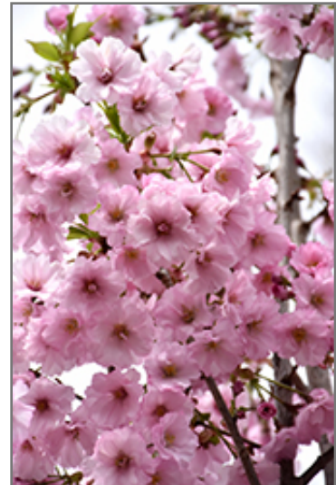
First Blush Flowering Cherry flowers

First Blush Flowering Cherry is recommended for the following landscape applications;