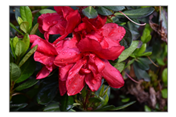
Encore Autumn Bonfire Azalea flowers

Encore Autumn Bonfire Azalea will grow to be about 3 feet tall at maturity, with a spread of 4 feet. It tends to be a little leggy, with a typical clearance of 1 foot from the ground. It grows at a slow rate, and under ideal conditions can be expected to live for 40 years or more.