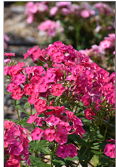
Ka-Pow Pink Garden Phlox flowers