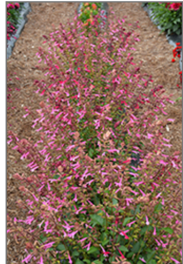
Skyscraper Pink Salvia in bloom

* This is a 'special order' plant - contact store for details