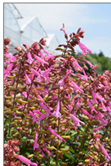
Skyscraper Pink Salvia flowers

Skyscraper Pink Salvia is an herbaceous perennial with an upright spreading habit of growth. Its relatively fine texture sets it apart from other garden plants with less refined foliage.